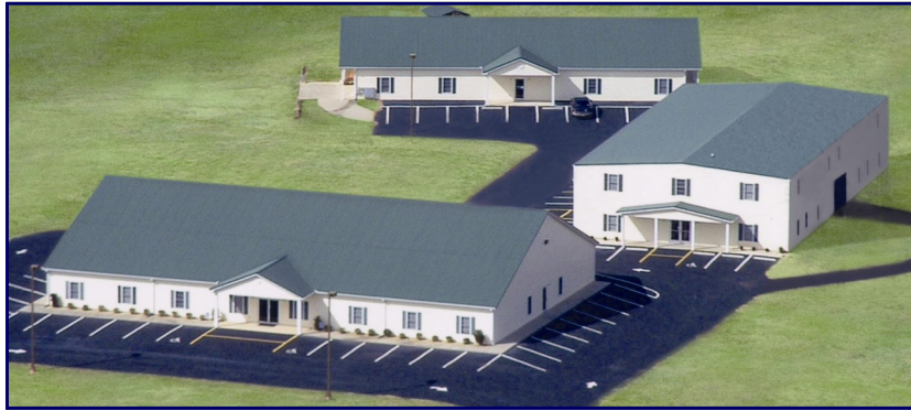
Macedonia Home Office Located in Hoschton, Georgia