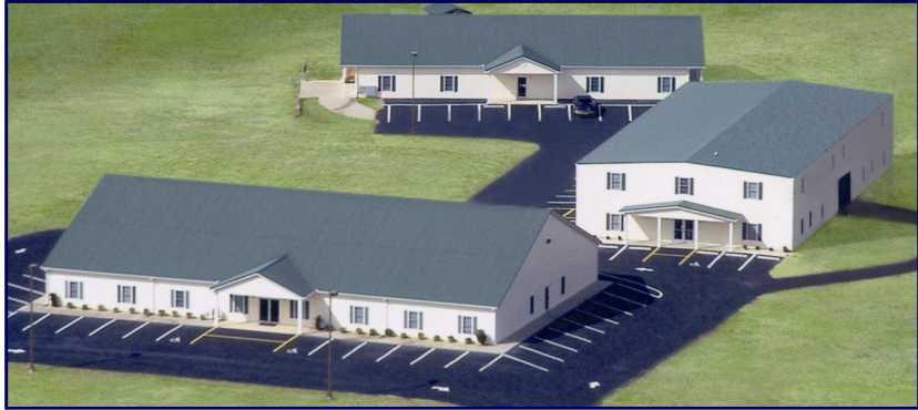
Macedonia Home Office Located in Hoschton, Georgia