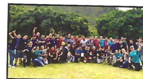
In March, 50+ men gathered for camp, striving to be men after God's own heart.