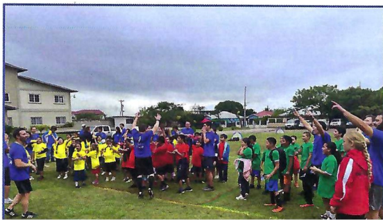
HAPPENING NOW!! This week we are having a soccer camp for children in the community. They receive shirts and water bottles, but best of all they hear God's word. I just walked through after today's message and there are many children receiving