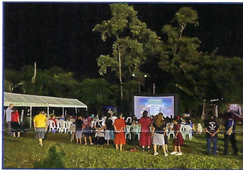
Evangelistic campaigns in October. We were blessed to go into 3 different communities and share the Gospel through videos, messages, and songs. After all was over each person attending got a pair of sunglasses and a walking taco meal. We have seen much fruit through these campaigns.