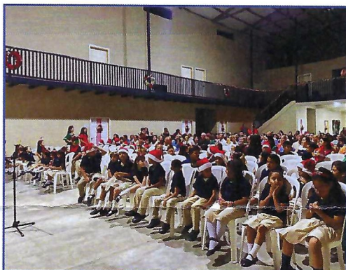
The school has become such a blessing to the church and vice-versa. During the Christmas program over 400 parents and grandparents were able to hear a clear Gospel message and we have seen many start coming to church with their children.