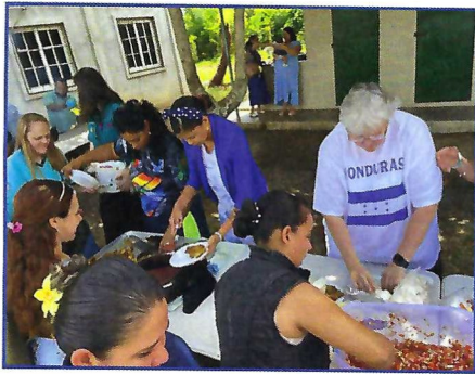
Honduran Independence Day. Serving a typical Honduran meal after services Sunday morning