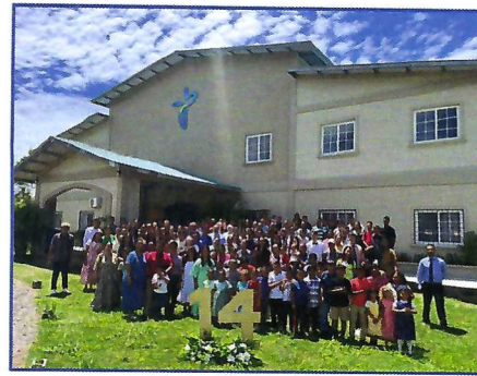
Our 14th church anniversary. God has brought us a long way in 14 years and I can't wait to see what He will do next.