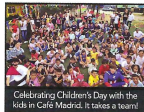
Celebrating Children's Day with the kids in Café Madrid. It takes a team!