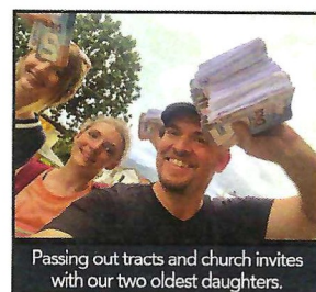
Passing out tracts and church invites with our two oldest daughters.