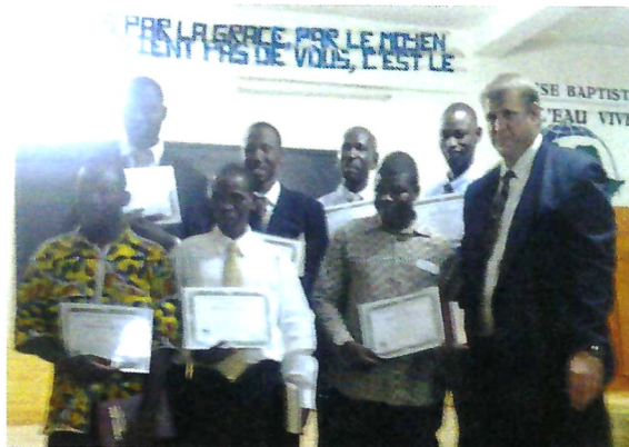
Our First Graduation in 2012