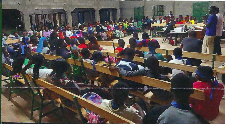
Teen Camp held at BaseCamp Burkina!!!

P.O. Box 519 Braselton, GA 30517 (706) 654-2818 www.mwbm.org