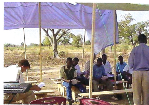
First Church Plant in January 2005