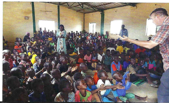
One of the many Vacation Bible Schools we hold each year.

It is more than just a property but a place where God has transformed lives.