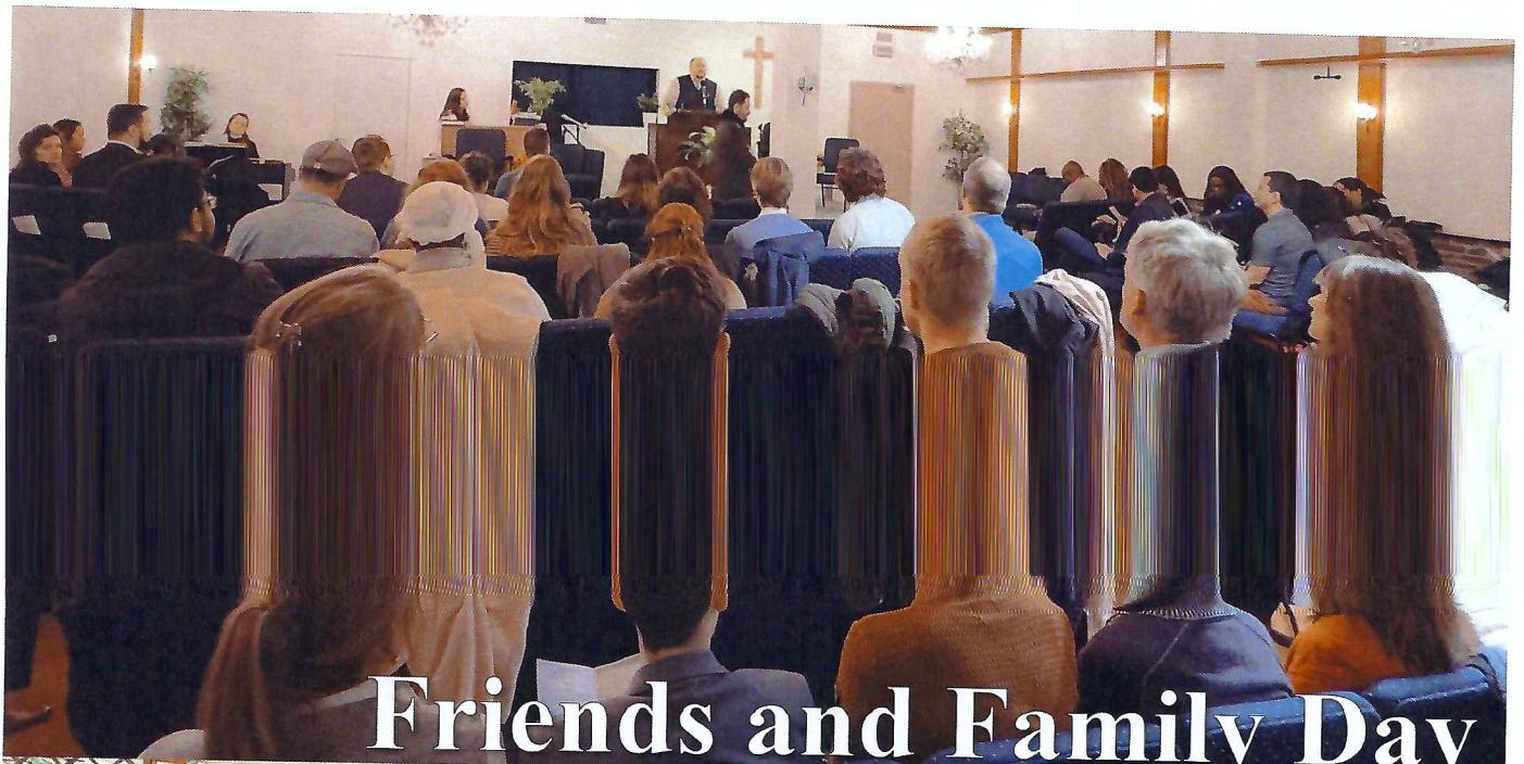
Friends and Family Day