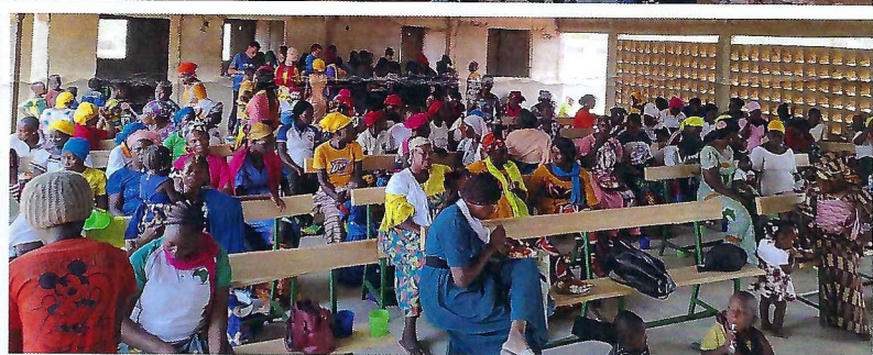
Top: Young Adult Camp - Left: Pastor's Conference Above: Ladies' meeting - Left: Bible College Below: Celebrating the kick off of the New Bible College year Bottom left: Invitation at Teen Camp Bottom Right: Churches working together to help build Base Camp Burkina