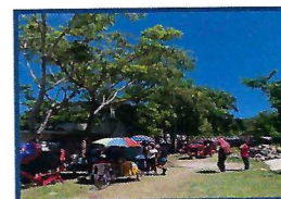
People were lined up and waiting by 5:30 each morning. This is the view outside my house, which is right next to the church