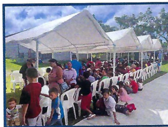
Waiting their turn to register and enter the clinic