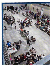
Overview of the medical outreach area

Thank you all so much for your support and prayers for me and for Honduras. I truly couldn't do this without each and every one of you. May the Lord truly bless you. Your Grateful Missionary and Fellow-servant,