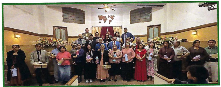
National Pastors and their wives.