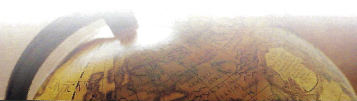
Roger Baker Acts 1:8