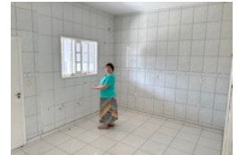
Everything AND the sink?

Then, there's yet another challenge when looking for a house to rent in Brazil. Many of us remember the term "everything but the kitchen sink." Though it's not a famous saying in Brazil, when renting a house here, it would be "everything AND the kitchen sink." When you terminate a rental contract here, you pack all your belongings AND "your" kitchen sink! Many rental houses here are stripped of everything "and" the kitchen sink! What this means for the next renter is that you have to bring or buy your sink and cabinets in addition to your kitchen appliances. Oh! Some rental houses have kitchen sinks (perhaps the previous renter left it behind?), but you must be first in the "rental race!" —our living-by-faith adventures. Amen!