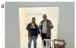
Gifts for the fathers