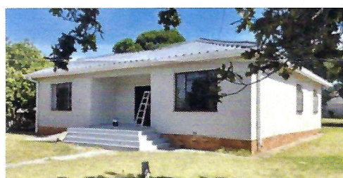
The house on the possible new church property.