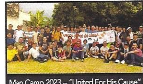
Man Camp 2023 — "United For His Cause"