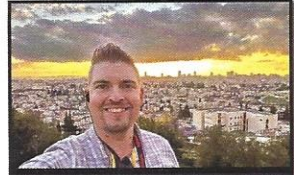
I joined a group of pastors on a trip to Israel in January before returning to the field. It was a life-changing experience that will forever mark me! Seeing the land of the Bible has brought the Bible to life, and will help me as I teach it to those who will teach others also.

"For what thanks can we render to God again for you, for all the joy wherewith we joy for your sakes before our God;" — 1 Thessalonians 3:9 —