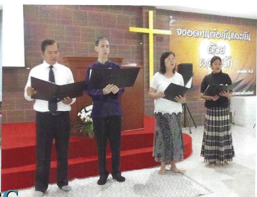
Revival Meeting at Lanna BC