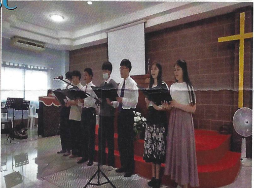
Wiang Ping BC Anniversary