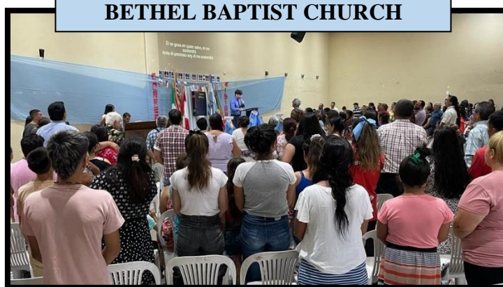
BETHEL BAPTIST CHURCH

Thank you for all your prayers and financial support!