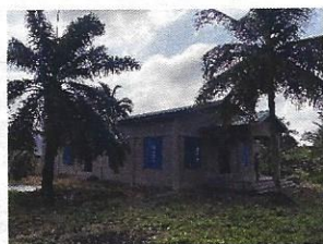
New Church Building at Agona

P.S. A special thank you to every individual and church who sent our family/ministry a Christmas gift. May the Lord bless your generosity.