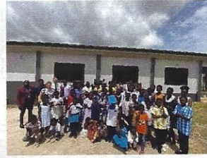
Charter Service at Mt. Calvary