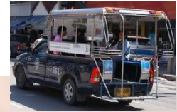
Needed Transport: BEST