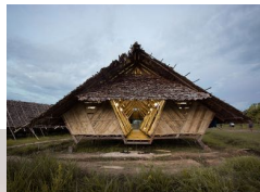
Needed Modest Farm House