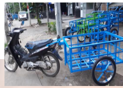
Needed Transport: GOOD