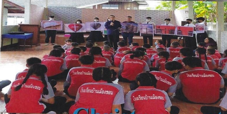
Christmas outreach in schools