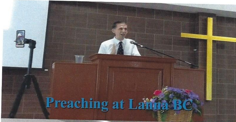
Preaching at Lanna BC