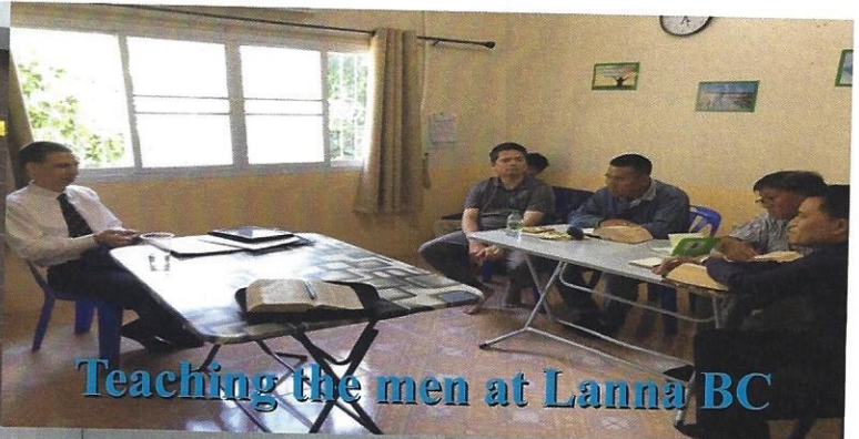
Teaching the men at Lanna BC