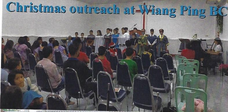
Christmas outreach at Wiang Ping BC