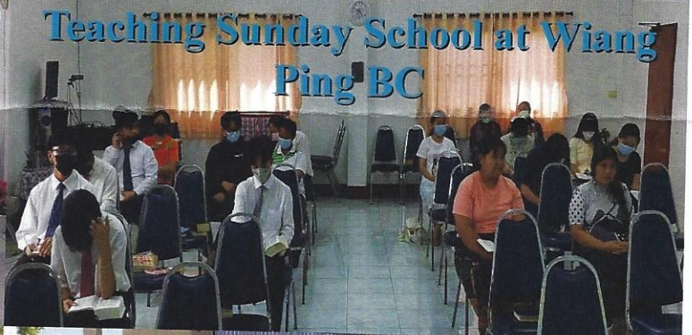
Teaching Sunday School at Wiang Ping BC