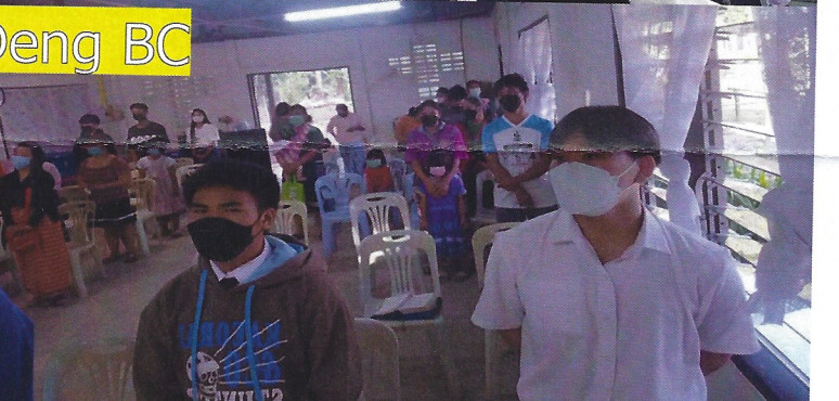
The building the Lord may allow us to use