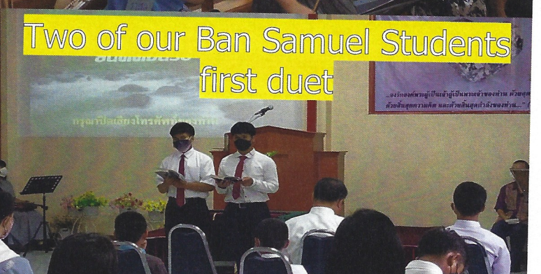
Pa Mai Deng BC