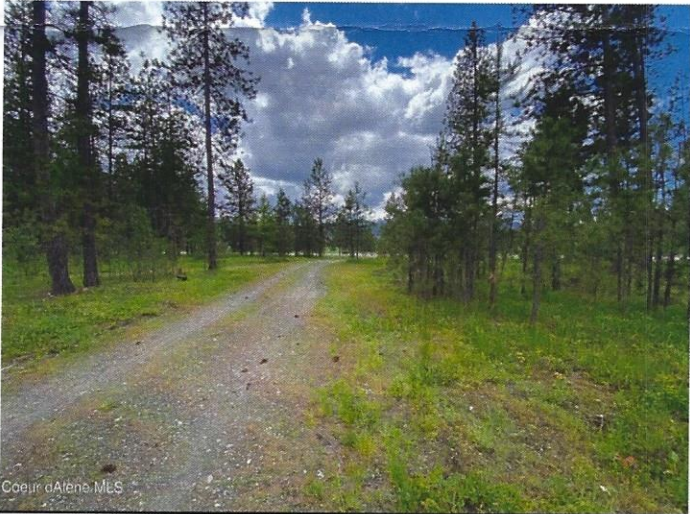
It is located on Hwy 41 in Blanchard Idaho. Which is the main artery of travel and well maintained throughout the winter months