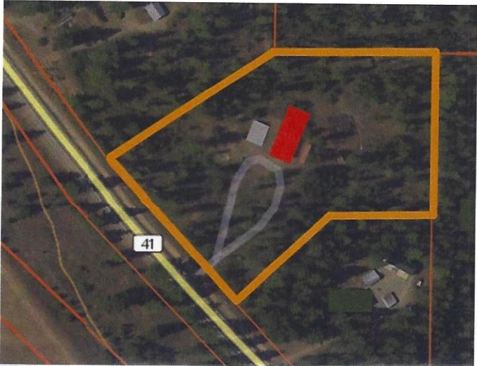
5 Acres with power, water, and septic already in and working. It is also has an RV spot with all the hookups.