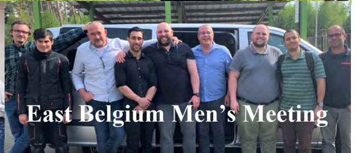
East Belgium Men's Meeting