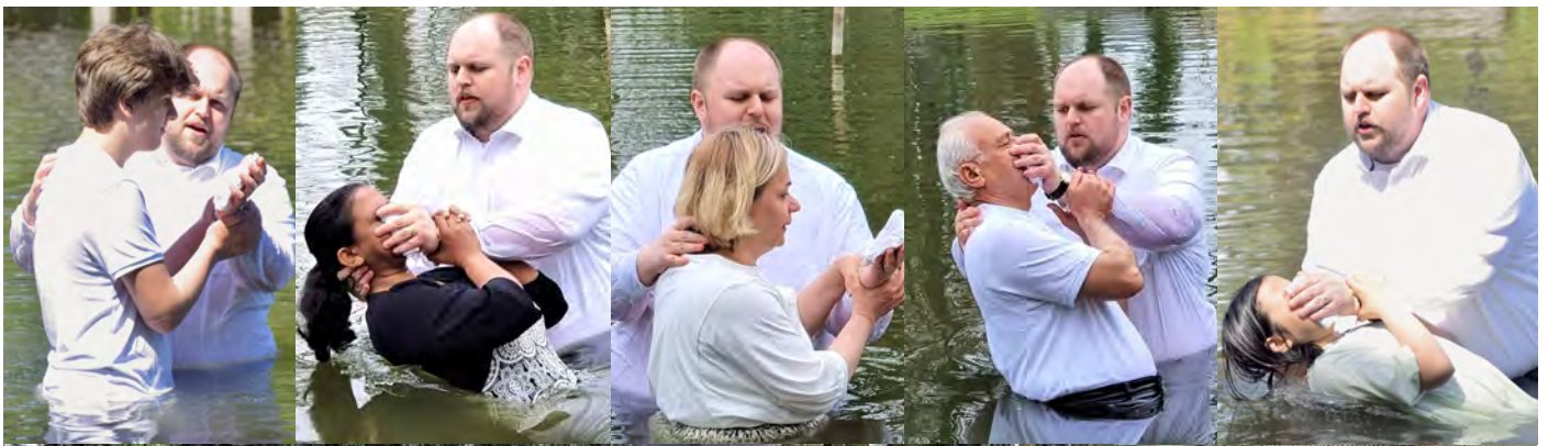
Baptism Services March & May