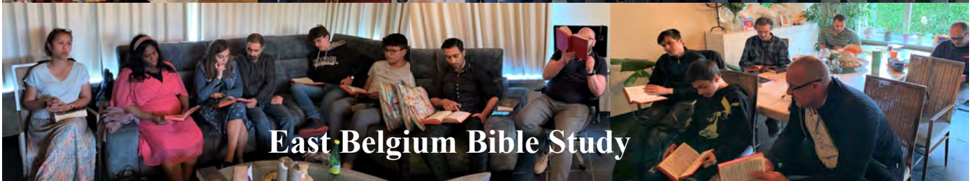
East Belgium Bible Study