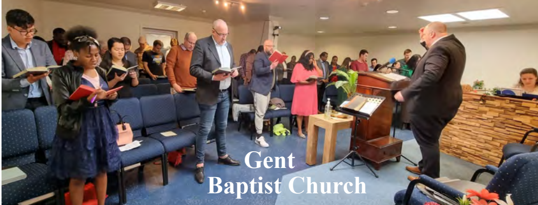
Gent Baptist Church