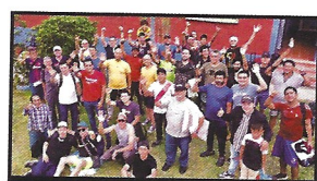
Our Man Camp was a great success. Thank God for raising up faithful men.