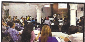
One of the best things about the Bible Institute this year is seeing graduates now teaching some of the classes!