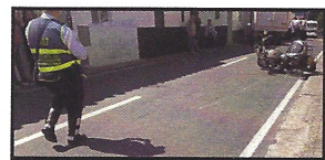
Transit police writing up the report after my motorcycle accident.