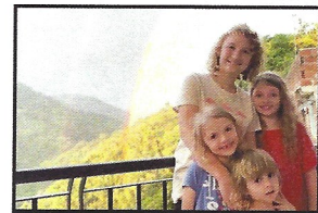
Our girls on the balcony of our home. God often sends rainbows to remind us of his goodness and faithfulness.

"And he said unto me, My grace is sufficient for thee: for my strength is made perfect in weakness. Most gladly therefore will I rather glory in my infirmities, that the power of Christ may rest upon me. Therefore I take pleasure in infirmities, in reproaches, in necessities, in persecutions, in distresses for Christ's sake: for when I am weak, then am I strong." 2 Corinthians 12:9-10