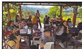
Our teen ministry is growing. We pray God uses these young men and women for his Glory!