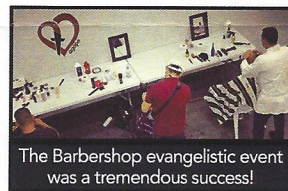
The Barbershop evangelistic event was a tremendous success!