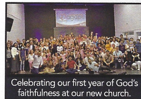
Celebrating our first year of God's faithfulness at our new church.