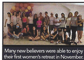
Many new believers were able to enjoy their first women's retreat in November.