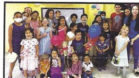
As our new church grows, so does the children's ministry!