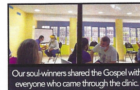
Our soul-winners shared the Gospel with everyone who came through the clinic.