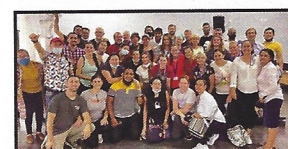
The MMO mission team, along with 50 volunteers from our churches, did a fantastic job at the clinic.