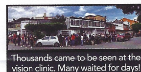
Thousands came to be seen at the vision clinic. Many waited for days!