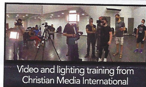
Video and lighting training from Christian Media International