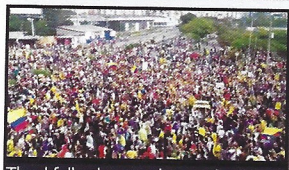
Thankfully, the marches and protests have been mostly peaceful. This was a block from our new church.