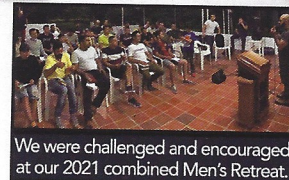
We were challenged and encouraged at our 2021 combined Men's Retreat.