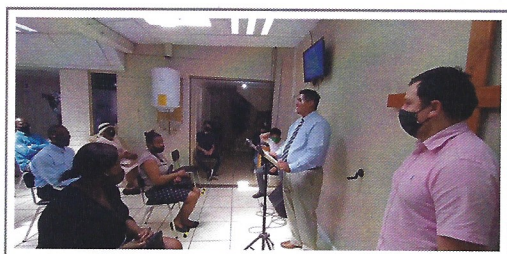
Observing the Lord's Supper during the first service since lockdowns.

Because every community has its own set of quarantine measures based on COVID numbers some of the churches here have yet to return to in-person services.