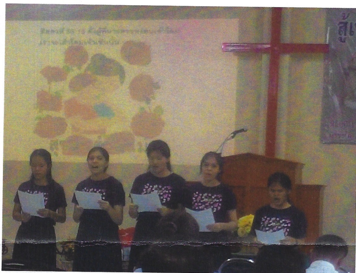
New house celebration of one of the church members in Pa Mai Deng.