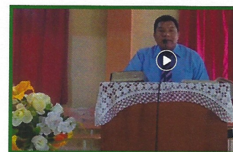
National Pastors reaching their Church people online

Much of Mexico, and pretty well all of Central America, is not allowing for normal Church services at this time. What a blessing it has been to see our missionaries using social media to preach to their Church people, and through this, share the Gospel around the world. It has been surprising to see people from other countries, people we don't even know, join in and later respond and give thanks for the truth they heard in the messages. God's Word continues to go forth around the world!